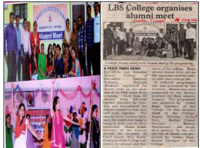
Alumni Meet 24 th of May 2017

On 24 th of May 2017, alumni meet was organised in the LBS College of education Raj Bagh, Kathua. In Which 30 alumni were present. The meeting was headed by principal and the alumni president. The main agenda of this meeting was to discuss the various issues in the college and how to cope with these problems. Many suggestions were taken in the meeting. The Alumni association demanded to provide ICT and Wi-fi connection in the college. The college management has taken the suggestion seriously and promised the students that it will soon provide ICT and Wi-fi connection in the college to the students and the teachers.