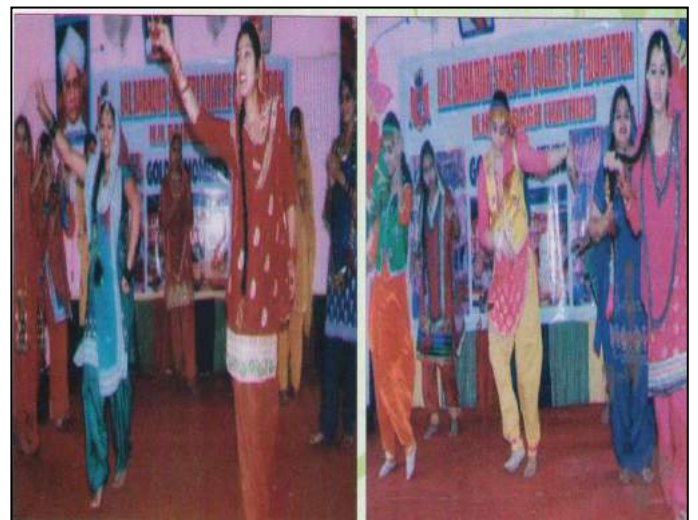
Alumni Meet 22 nd of September 2015

On 22 nd of September 2015, alumni meet was organised in the LBS College of education Raj Bagh, Kathua. In Which 30 alumni were present. The meeting was headed by principal and the alumni president. The main agenda of this meeting was to discuss the various issues in the college and how to cope with these problems. Many suggestions were taken in the meeting. The Alumni