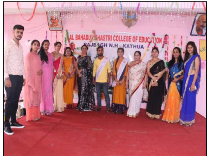
Alumni Meet 22 nd of May 2016

On 22 nd of May 2016, alumni meet was organised in the LBS College of education Raj Bagh, Kathua. In Which 30 alumni were present. The meeting was headed by principal and the alumni president. The main agenda of this meeting was to discuss the various issues in the college and how to cope with these problems. Many suggestions were taken in the meeting. The Alumni association demanded to introduce E-journals and books regarding new B.ed two years curriculum. The college management has taken the suggestion seriously and promised the students that it will soon provide E-Journals and the books regarding new B.ed two years curriculum to the students and the teachers.