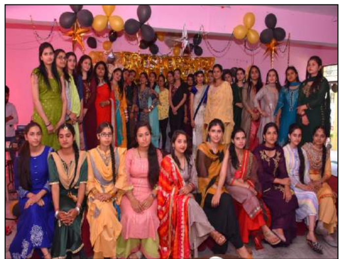
Alumni Meet 15 th of September 2018

On 15 th of September 2018, alumni meet was organised in the LBS College of education Raj Bagh, Kathua. In Which 30 alumni were present. The meeting was headed by principal and the alumni president. The main agenda of this meeting was to discuss the various issues in the college and how to cope with these problems. Many suggestions were taken in the meeting. The Alumni association demanded to strengthen