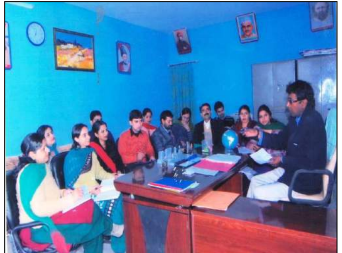
Alumni Meet 24 th of April 2014

On 24 th of April 2014, alumni meet was organised in the LBS College of education Rajbagh, Kathua. In Which 30 alumni were present. The meeting was headed by principal and the alumni president. The main agenda of this meeting was to discuss the various issues in the college and how to cope with these problems. Many suggestions were taken in the meeting. The Alumni association demanded extra computer classes for the student and it is a changing trend in education. the college management has taken the suggestion seriously and promised the students that it will soon start extra computer classes and have had provision for these extra classes.